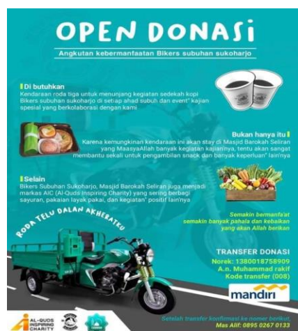
Figure 3.5: Fundraising of BSS

Every Friday, we have a food-sharing program called Jumber (Jumat Berkah, Friday Blessing) Bikers Subuhan Klaten. We will distribute mainly to the congregational Friday prayer at the mosque that will be used for the main BSK activity the day after. If you are interested in donating only Rp. 10,000 / portion, you can already contribute to satisfying the hearts of others and filling the stomachs of other brothers and sisters in faith. According to the Prophet, this is a major deed it is one of the four keys to getting Jannah apart from spreading greetings, establishing friendship, and praying at night. Please feel free to join us in sharing food at the Jumber BSK event; it can be any amount as long as it is sincere. 137