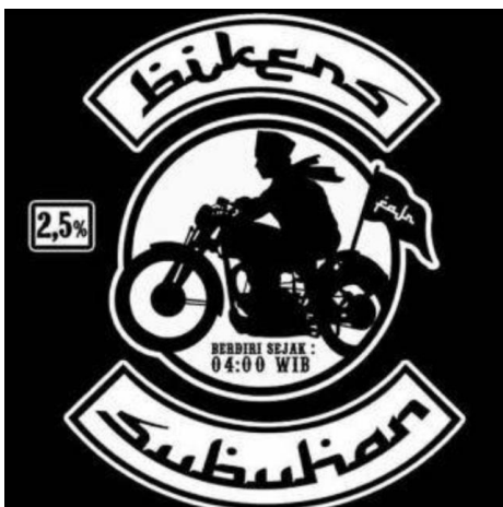
Figure 1: The logo of Bikers Subuhan