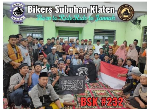
Figure 3.2: Safar Ride #232