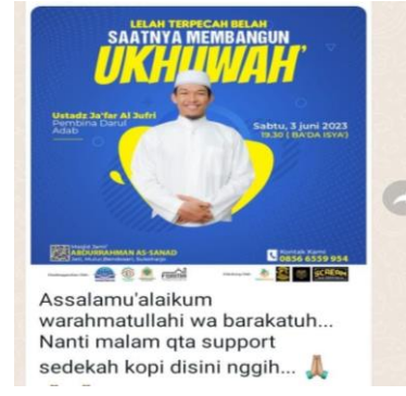
Figure 3.4: Supporting other hijrah communities.