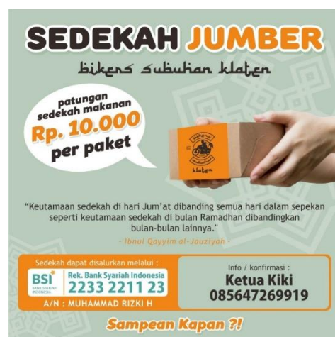
Figure 3.6: Fundraising of BSK