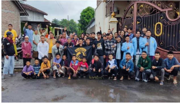
Figure 3.3: Safar Ride #190