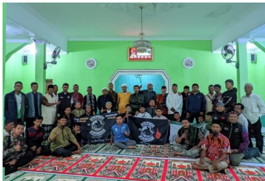
Figure 3.1: Safar Ride #226

We do not specify special requirements to join this movement, the important thing is that you want to pray and participate in other BSK activities, not necessarily all activities, because every day we (have) full activities. Presently we have more than 300 members, which continues to grow every week because currently, we are also (starting to) actively use social media such as IG (Instagram), FB (Facebook), and WhatsApp. In addition, we also organize social activities such as charity for orphans and the elderly, free haircuts, free circumcision, and other agendas to attract people to join our movement. 127