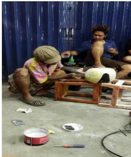
Figure 3. 8 Burouq Assembly by Punks

During my observation, Tasawuf Underground students are taught to produce economically valuable products such as custom motorcycle assemblies with various designs according to customer requirements assisted by the experts in any motorsport from 150 to 250 cc. Meanwhile, they call this activity Burouq