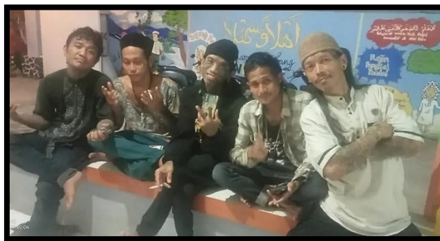
Figure 3. 2 Punk After Prayer

ideology and Tasawuf as a religious approach, practice, and moral value. Moreover, some street punks are proud of their identity as a "punk," but still carry out religious teachings and practices (Dhikr, Sholat, Taubat, Fasting) as their expression regardless of the punk symbols or attributes they use, and without going to the streets and committing harmful acts. 129 This indicates that the dimensions of religiosity, such as ideology, rituals, experiential, intellectual, and the consequences that exist in the citizens of "punk Islam" consciously or unconsciously, align with their commitment and consistency with the environment and religious teachings or practices. However, the influence of religion in Indonesia extends to all areas of society and culture. 130 So it is not surprising that the influence of religion also has an impact on Indonesian punks.