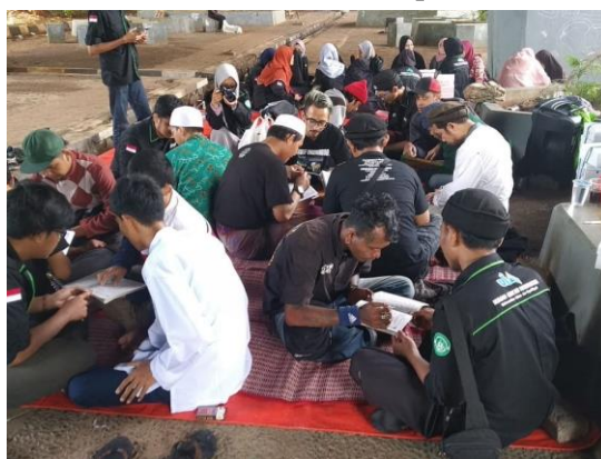
Figure 3. 5 Offline Preaching Tasawuf Underground Community Under Flyover

Peta Jalan Pulang or abbreviated as (PJP) has two objectives; First, The Roadmap to Return to Allah. Introducing religious teachings and good morals allows them to understand their religion and be respected as humans who have respect. Second, returning to the family, in this concept, is the creation of economic empowerment and development