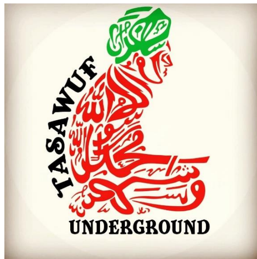
Figure 3. 3 Symbol of Tasawuf Underground

Afterward, Several things must be considered in the phenomena that occur in Christian punk, like two peas in a pod with Islamic punk. Christian punk has a mission to spread evangelical doctrine in the form of ideology, spiritual expression, and repentance into punk lyrics. Even if, it seems imposing, because religion and punk are such nemesis in the western world. 139 In contrast, “Islamic punk” that I found in the Tasawuf Underground community used Islamic teaching as an ideology, Sufism as an approach to emerge a sense of affirmation, as well as religious and moral practices and values. Meanwhile, Islamic punk has elements; Islamic ideology, shared feeling, religious expression, empowerment. Furthermore, religious expression has an impact on emergence; religious piety as a result, of religious experience and consequences, and is manifested in patterns of life.