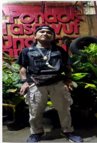
Figure 3. 1 Punk Style

Meanwhile, the shared meanings found in subcultures are deeply applied and implemented into practices and rituals such as Christian punk, which combines beliefs, Christian values, and punk elements. by expressing Christian beliefs that include the spiritual life, repentance, social criticism, and moral values with everyday punk messages and styles, it is undeniable that the "counterculture" values and ethos of punk are in sharp contrast to the values and norms of mainstream Christianity. 127 The point is that Christian